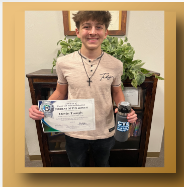
Devin Trough Estrella Foothills